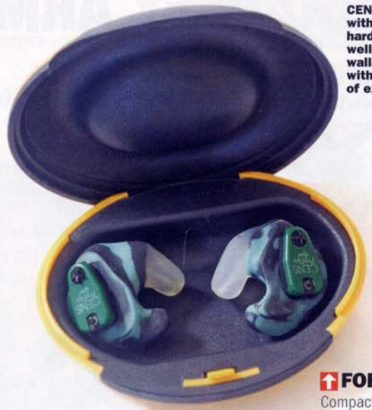
CENS come with a neat hard case as well as a soft wallet along with a host of extras

There is also an interesting new development as Martin detailed: "We are now building these for the Scandinavian markets which incorporate an inductive pickup input. These units are worn as usual but the hunter also wears a neck loop