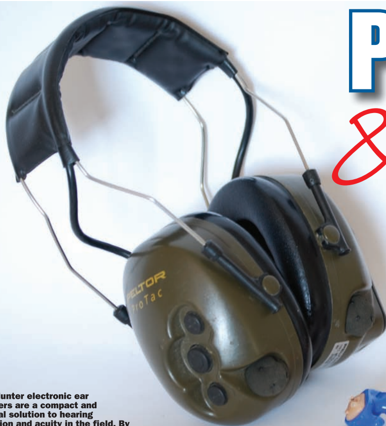
CENS Hunter electronic ear defenders are a compact and practical solution to hearing protection and acuity in the field. By comparison a set of the conventional Peltor Pro-Tac active muffs